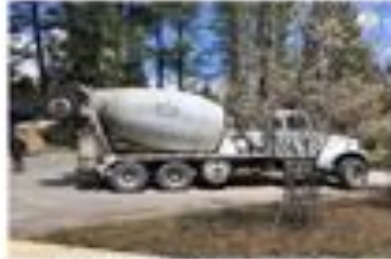
Week 4 - Pouring foundation