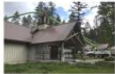
Week 6 - Up and over we go again