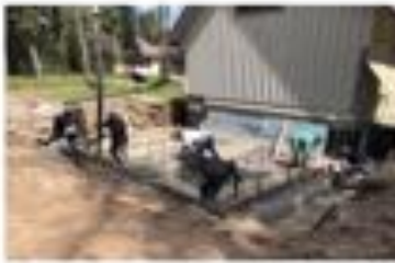
It takes a village...or at least a lot of skilled works