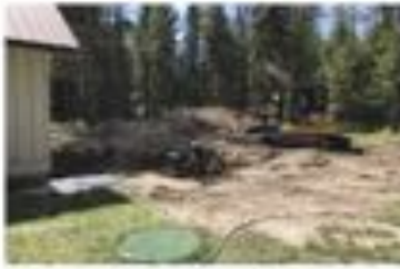
Week 3 - Adding base material