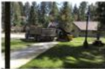
Hauling away old laterals