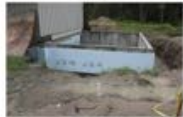
More rain on Pentecost but ready for the next step....