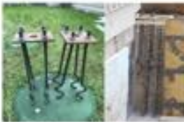
Bases to hold large steel beams in place