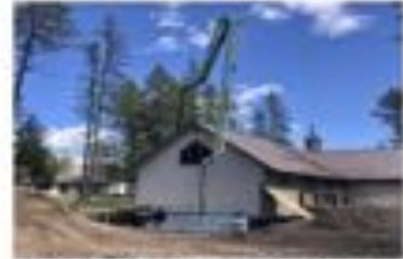
Tons of concrete up and over the sanctuary