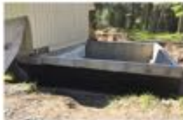
Forms stripped and foundation wall damp proofed