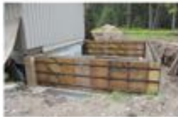
Foundation walls formed and ready to be poured