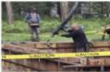
Filling in the forms