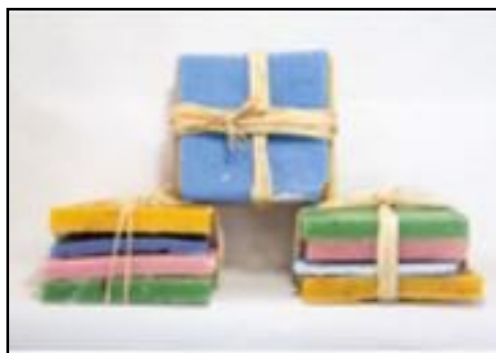
Rustic Cut Set $10

Look doe us to be providing samples after Sunday services and drive-thru communion for the good of the whole. Buy some soap, wash your hands, and say a prayer for the Navajo Nation while you are at it!