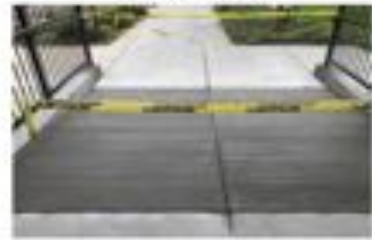
Week 5 - New ramp - YAY!